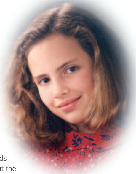
Polly Hannah Klaas 1981–1993